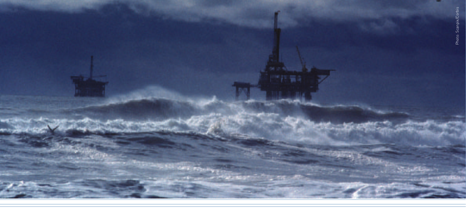
Danger offshore – as opposed to a normal 12-meter wave with a force of 6MT/m², a breaking freak wave reaches a force of around 100MT/m²

world that were greater than 25 meters in height. This was a shocking revelation. It showed that freak waves are real and much more common than expected.